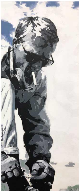
LEFT: The Steve McQueen painting for charity went to the highest bidder and started a great new art collection!