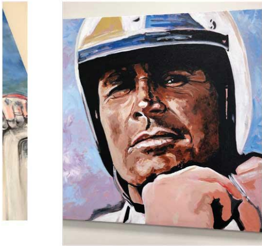
ABOVE: James Garner